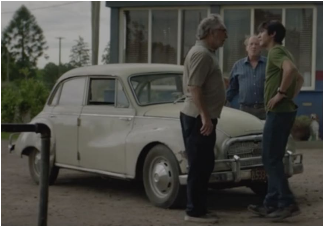
Shown On the Cover : A DKW similar to the one that was blown up in Heroic Losers (2019)

Below: A shot from the movie Heroic Losers (2019)