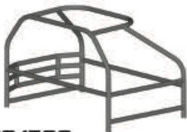
CSC 1500 ECONO CAGE $ 375.75