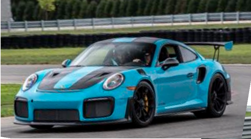
Some private Track Day photos from Brad Vollmer, driving the Ford GT and the blue Porsche GT2RS