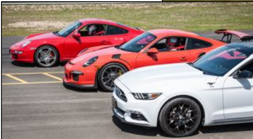
ON THE COVER BRAD VOLLMER IN 2016 PORSCHE GT3 RS