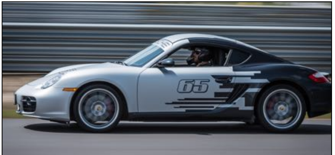
BRYAN VOLLMER PORSCHE 2006 CAYMAN S