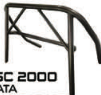
CSC 2000 MIATA ROLL BAR KIT $ 682.25