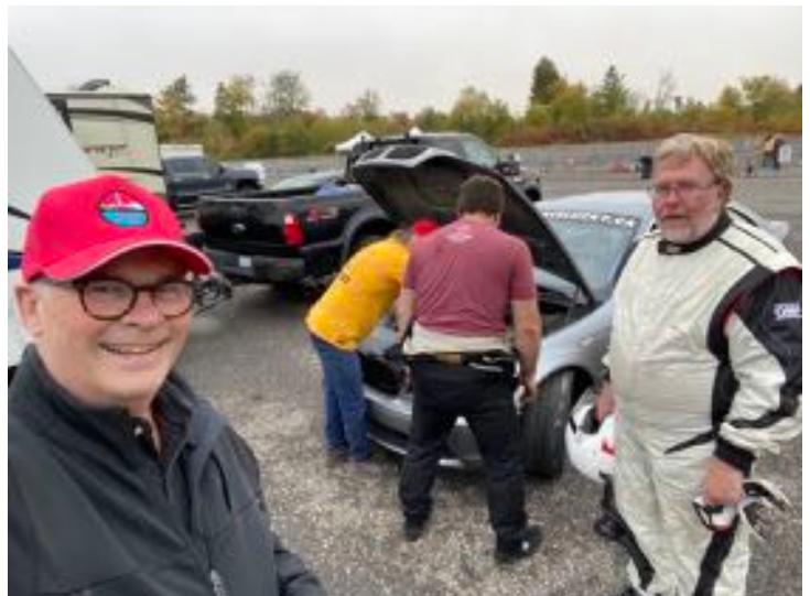
Looking for the problem

Don't leave your insurance company's driver tracker turned on if you forget your cell phone in your racing suit pocket