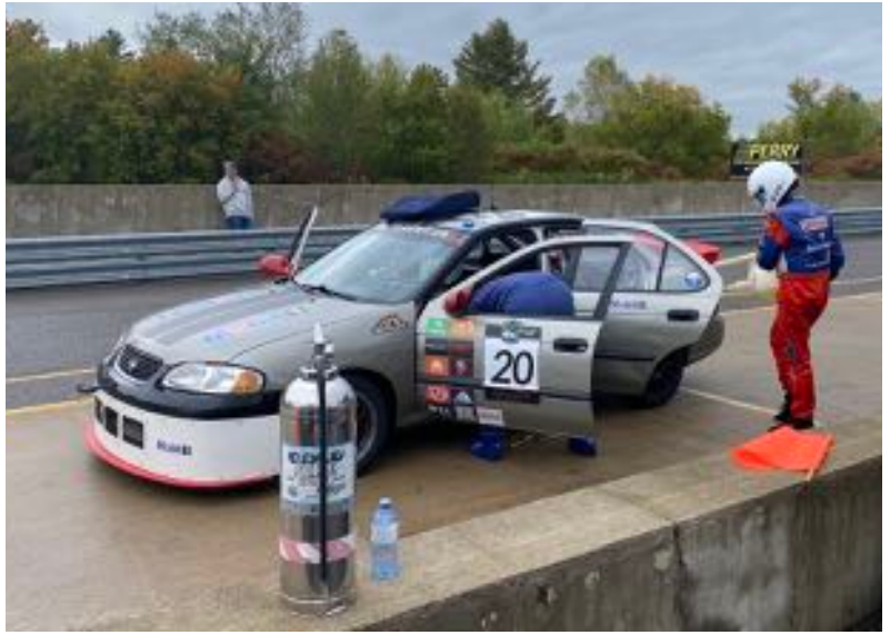
Gary Vernon's Sentra gassing up