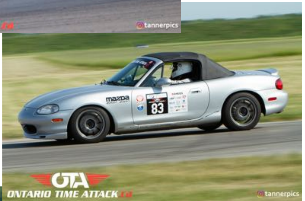
Matt Clough Car 83 Event 1