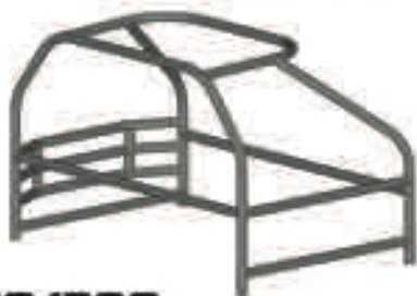
CSC 1500 ECONO CAGE $ 375.75