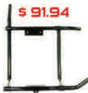
CSC 1605 GENERIC SEAT MOUNT KIT