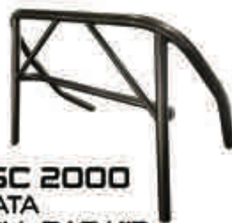
CSC 2000 MIATA ROLL BAR KIT $ 485.00