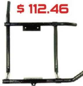
CSC 1605 GENERIC SEAT MOUNT KIT