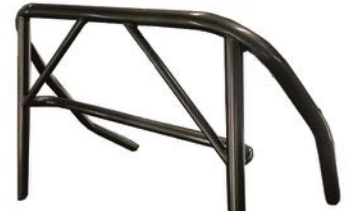
CSC 2000 MIATA ROLL BAR KIT $ 682.25