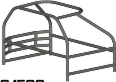
CSC 1500 ECONO CAGE $ 457.18