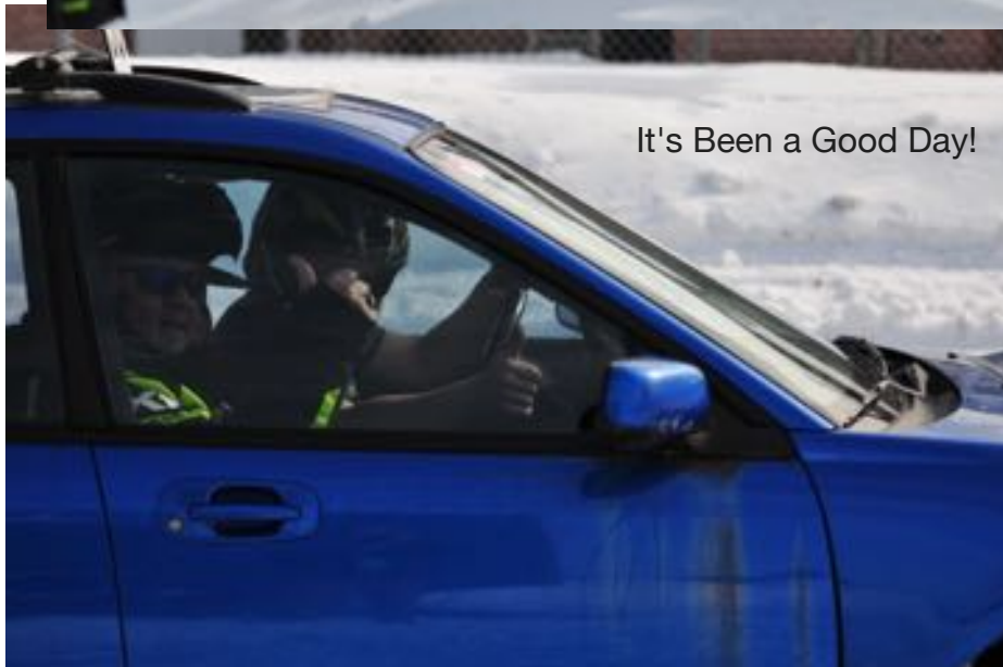
It's Been a Good Day!