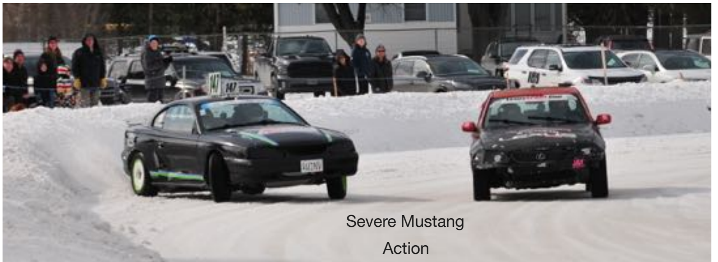
Severe Mustang Action