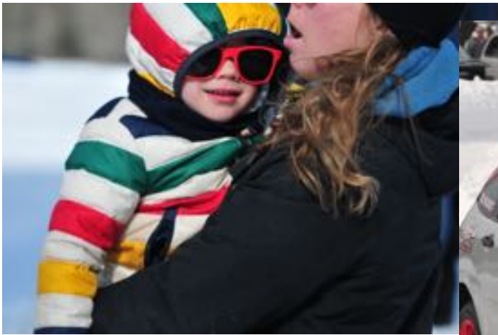
Ice Race Fans are Cool!