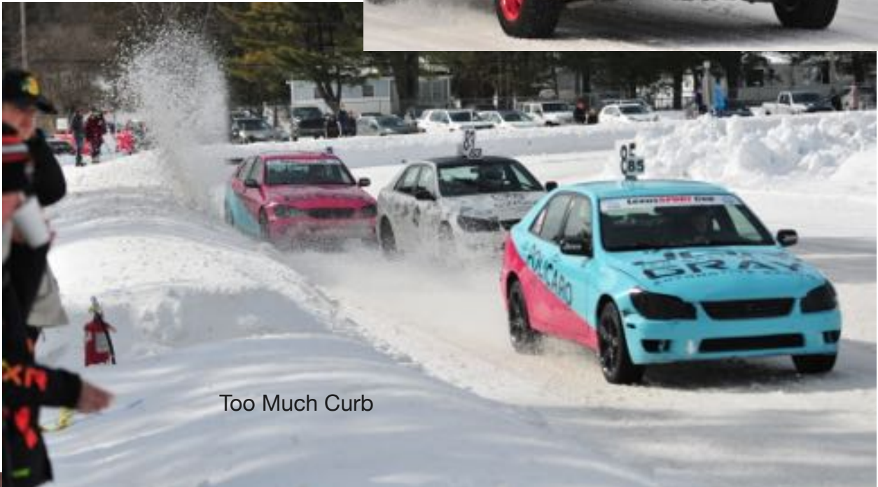
Too Much Curb