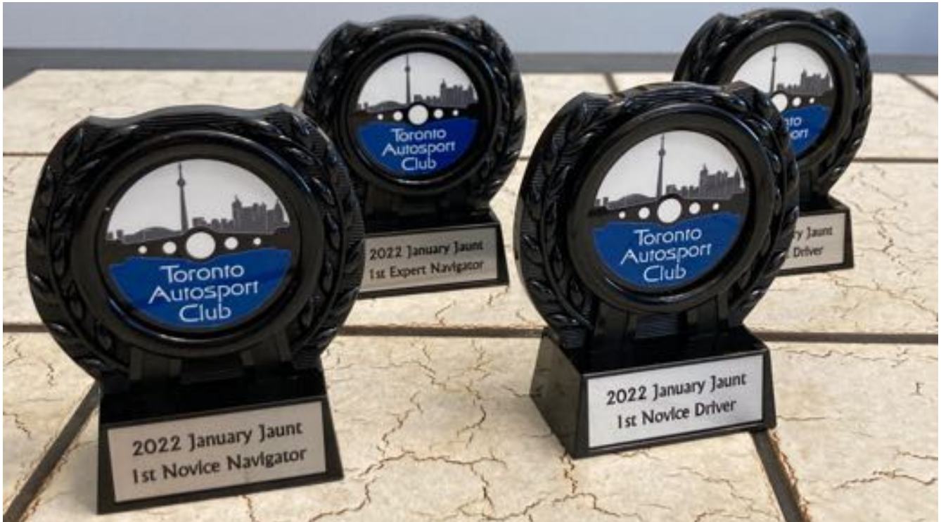
January Jaunt awards are ready to be awarded... to you?

Navigational rallying is back! January Jaunt Car Rally registration opened on the weekend, and it looks certain that the event will run on the revised date of March 26. Navigational rallies are friendly to beginners, experts, and everyone in between. If you try it and do well, there are awards!