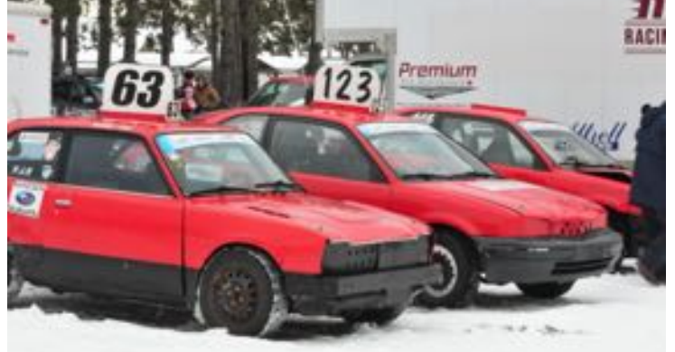
Parking for Red Cars Only?