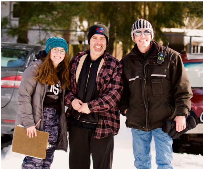
A Short Break before getting the next Race Gridded.