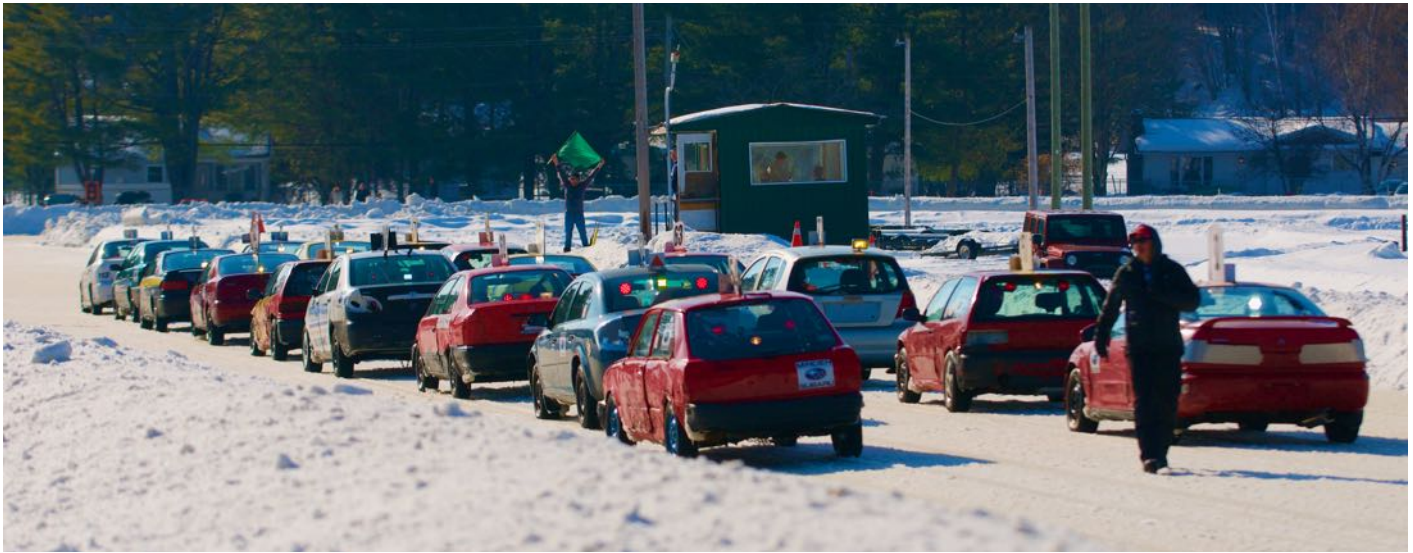
All lined up and Green to Go