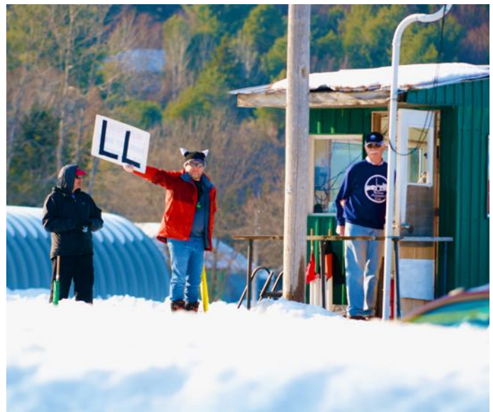
No, Not '77' it's 'Last Lap'!