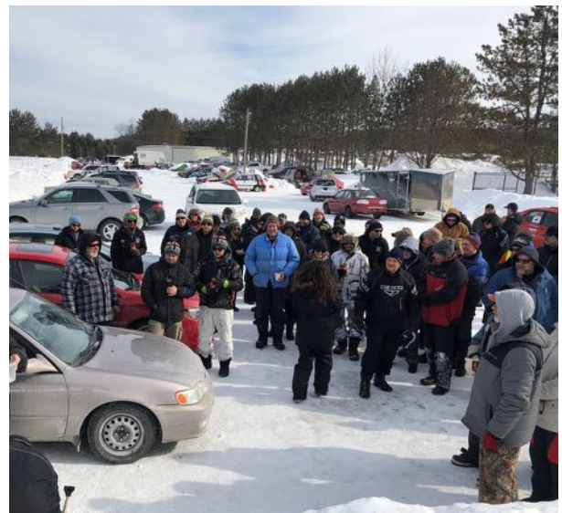
The Drivers were Paying attention !