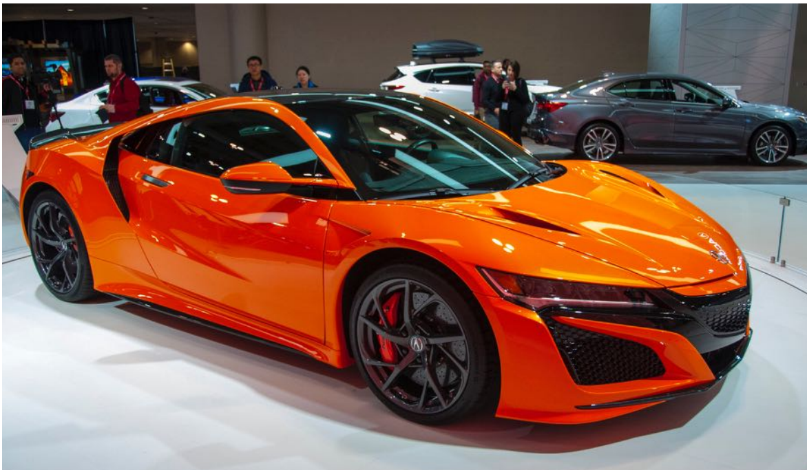
The Acura NSX was another very pretty car