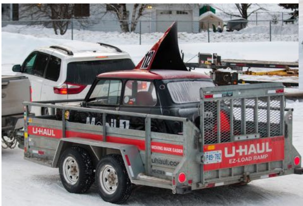
The Shark in its Cage