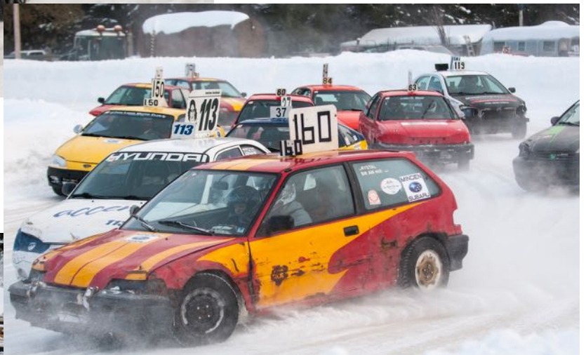
Tight racing in the corners!

ON THE COVER MORE RACING AT MINDEN.