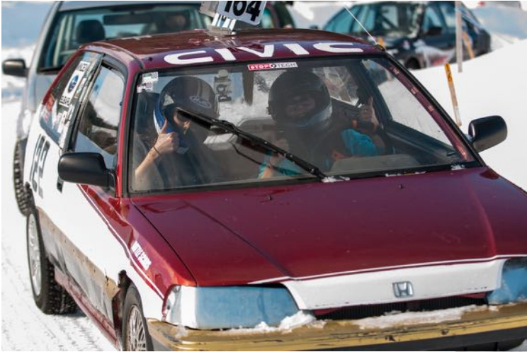
2 thumbs up for Ice Racing!