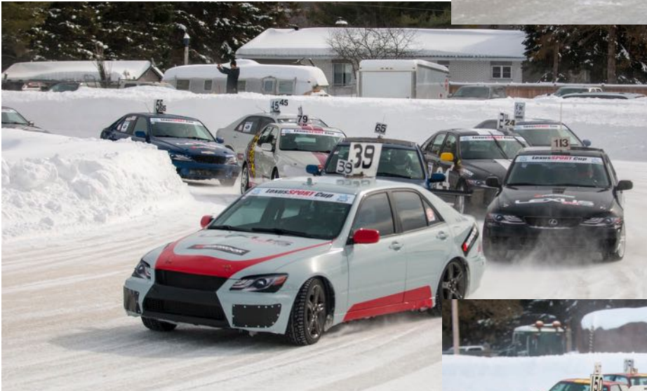
Here come the Lexuses(?) Lexi(?)