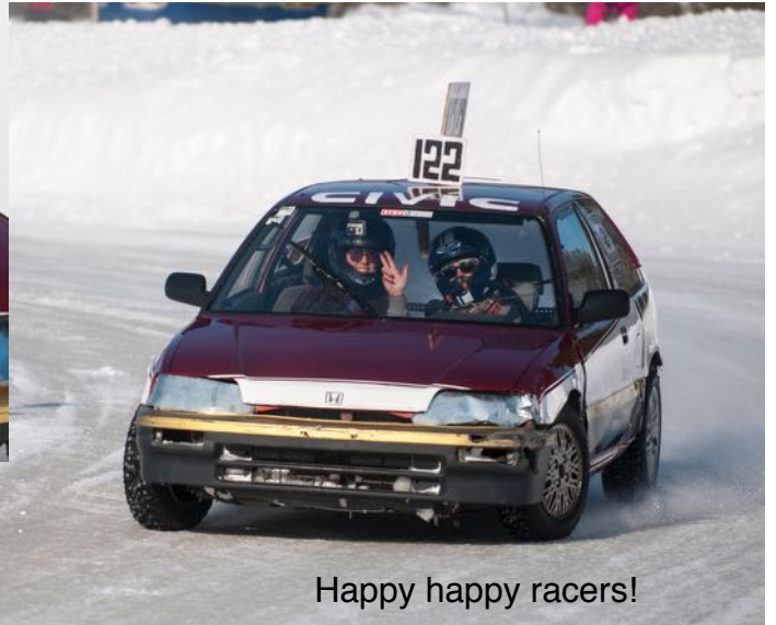
Happy happy racers!