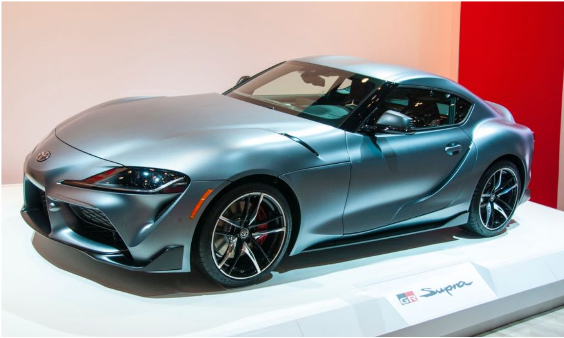
The prettiest car at the show: The Toyota version of the BMW Z4