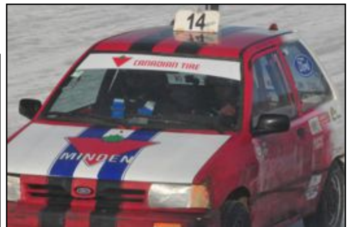
Heather Peckham-Hughes (#14)