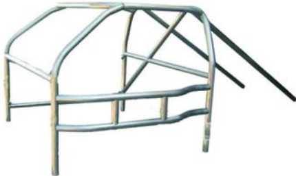
CSC 1503 CHUMP CAR KIT $ 492.34