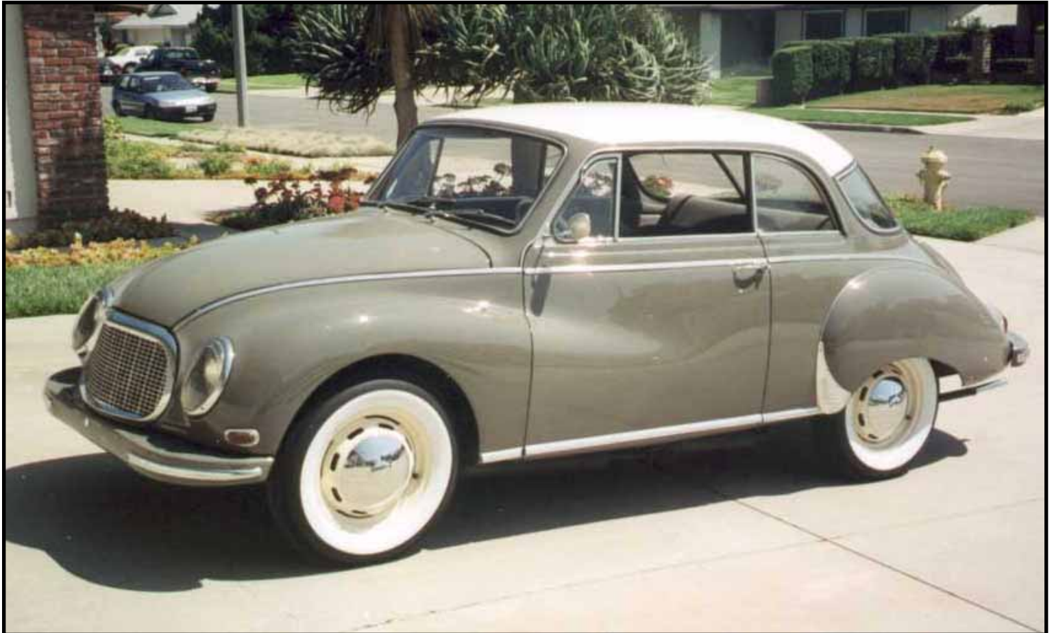
1958 DKW F93 3=6 2 Door Coupe