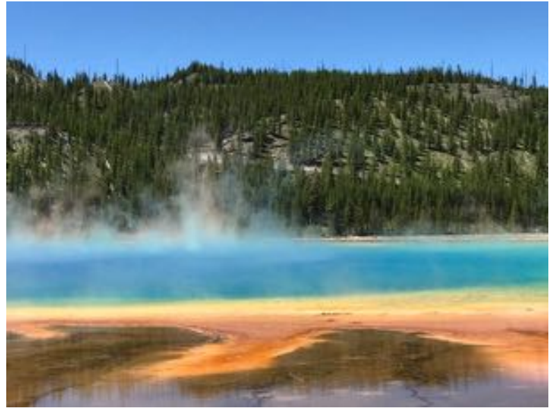
Prismatic Lake, Yellowstone