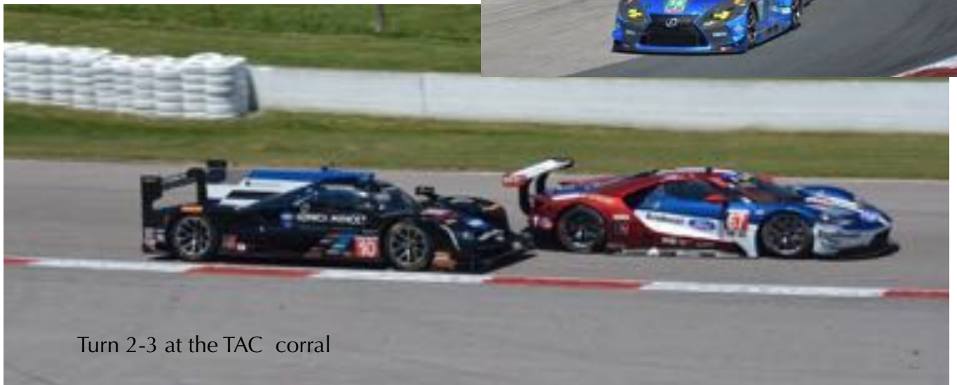
Turn 2-3 at the TAC corral