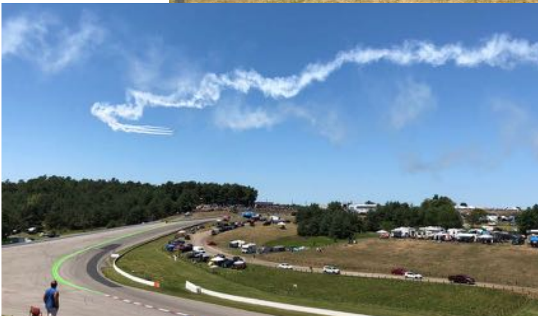
Trio of Harvards performing flyovers prior to the main race