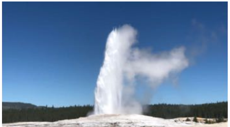
“Old Faithful” erupting again.