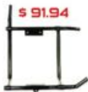
CSC 1605 GENERIC SEAT MOUNT KIT