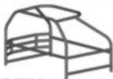
CSC 1500 ECONO CAGE $ 375.75