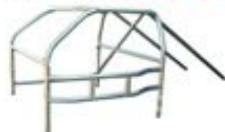
CSC 1503 CHUMP CAR KIT $ 402.50