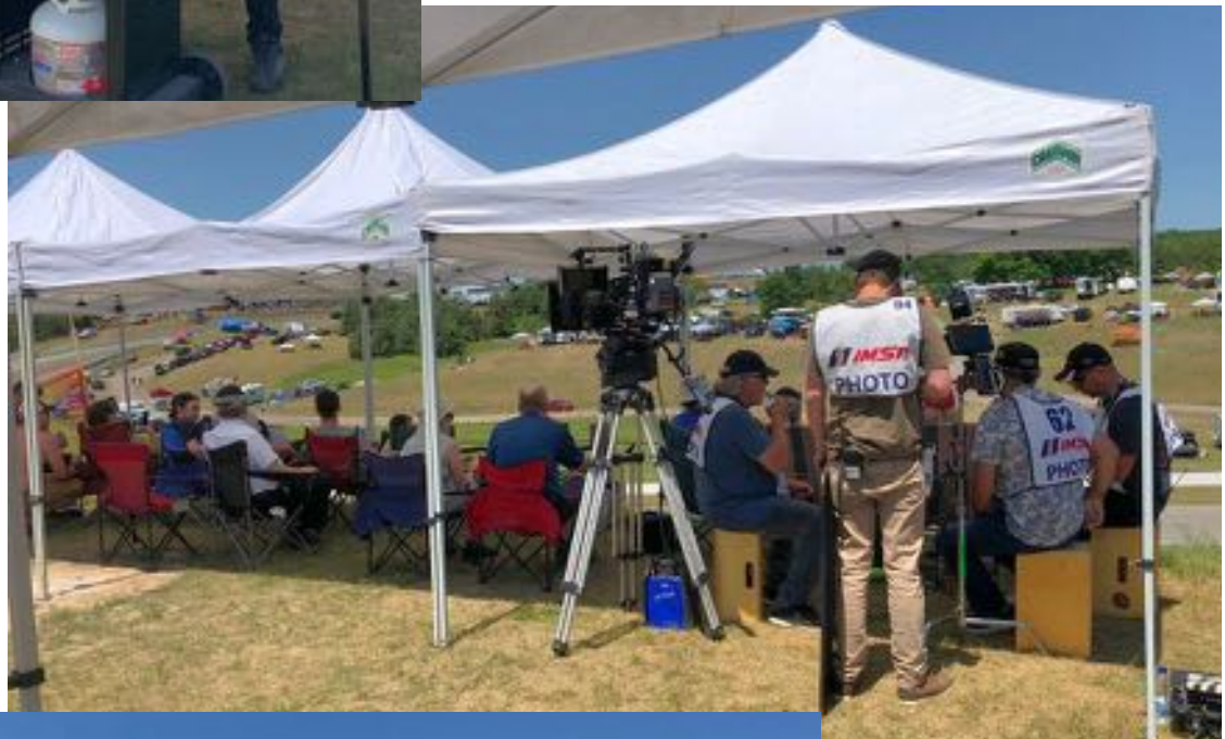
Film Crew attempt to crash our barbecue (We had the best vantage point, too)