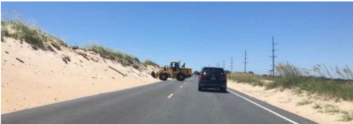
No snow, but sand has to be shovelled at Cape Hatteras