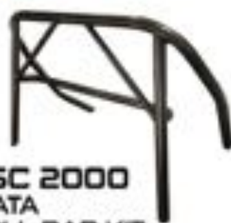
CSC 2000 MIATA ROLL BAR KIT $ 485.00