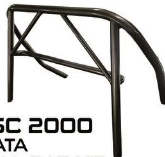
CSC 2000 MIATA ROLL BAR KIT $ 485.00