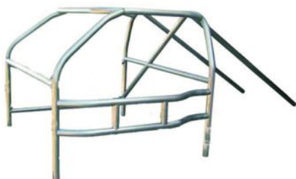
CSC 1503 CHUMP CAR KIT $ 402.50