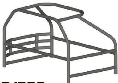
CSC 1500 ECONO CAGE $ 375.75