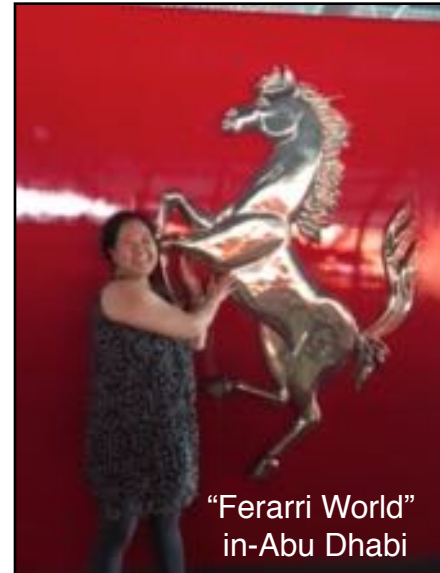
Yas island, Abu Dhabi where the F1 Grand Prix is held in November

More importantly, we also went to Abu Dhabi, it's a 45 minute drive from Dubai.