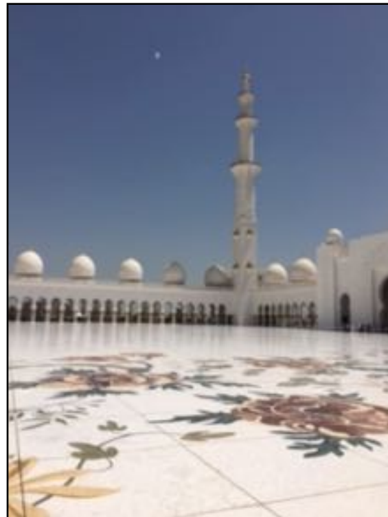
The Sheikh Zayed Grand Mosque, Abu Dhabi