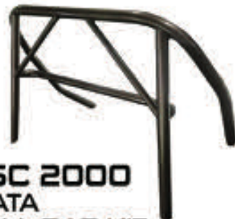
CSC 2000 MIATA ROLL BAR KIT