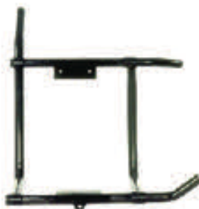
CSC 1605 GENERIC SEAT MOUNT KIT