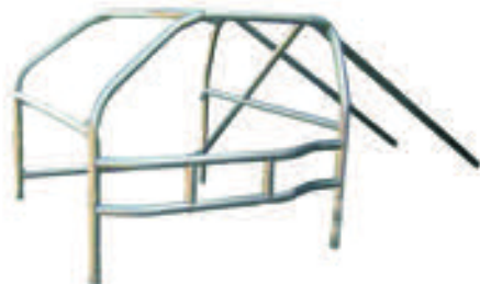
CSC 1503 CHUMP CAR KIT