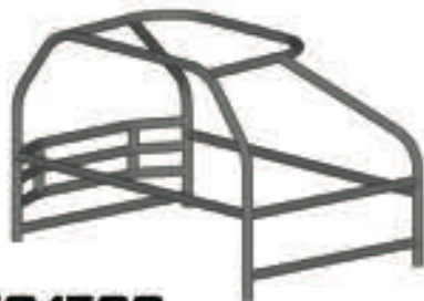
CSC 1500 ECONO CAGE