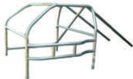
CSC 1503 CHUMP CAR KIT $ 492.34