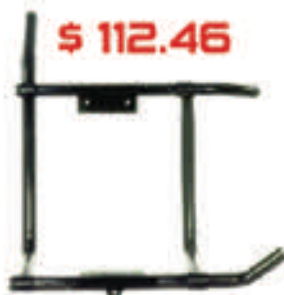
CSC 1605 GENERIC SEAT MOUNT KIT