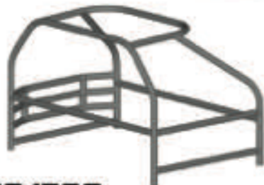
CSC 1500 ECONO CAGE $ 457.18