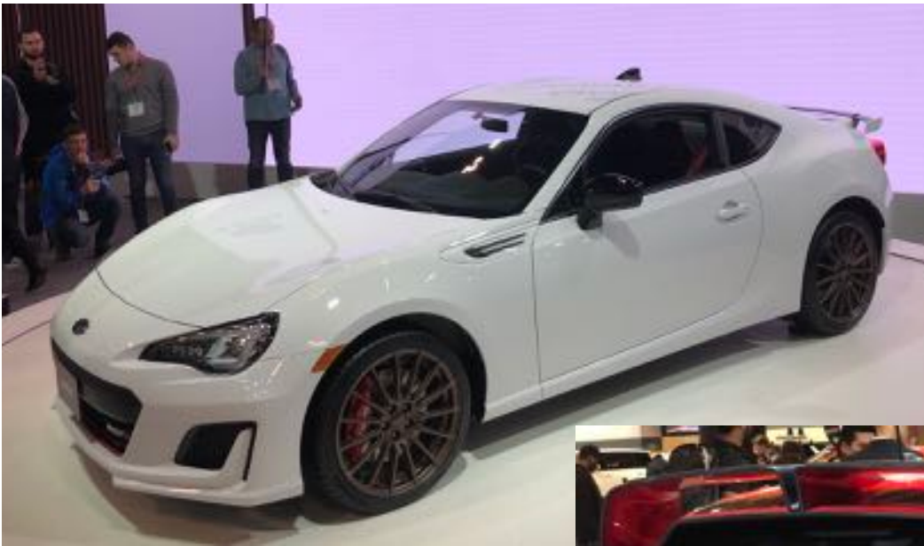
The Subaru BRZ tS Special Edition - only available in non-metallic White

When you need to make sure that everyone knows you're running with the GP package!