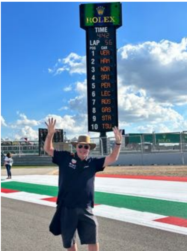
Lance was ninth!

Finally Sunday - Race Day arrived. The traffic was much worse getting to the track, and our bus was held up when HRH Harry came by in a motorcade. We missed the support races, but were in our seats for the grid prep. We forgot our binoculars, so couldn't see any of the Sky F1 crew in the paddock – or the not-so-giant video screen across the track from our seats. The race was a blast, with Lando Norris passing Max Verstappen into turn 1 at the start. It didn't last long, and Max won as usual. Both Aston Martins started from the pits, as they had made changes to the cars since qualifying. It was fun watching them cut through the pack, and in the end, Stroll finished 9th and later bumped to 7th after Hamilton and Leclerc were disqualified.