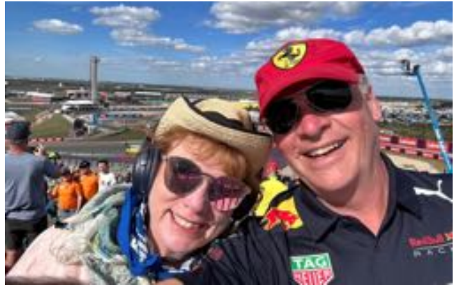
When the anthem played, most people turned and faced the Texas flag.

On one end of the track, there was a giant US flag. On the other end, was a giant Texas flag.