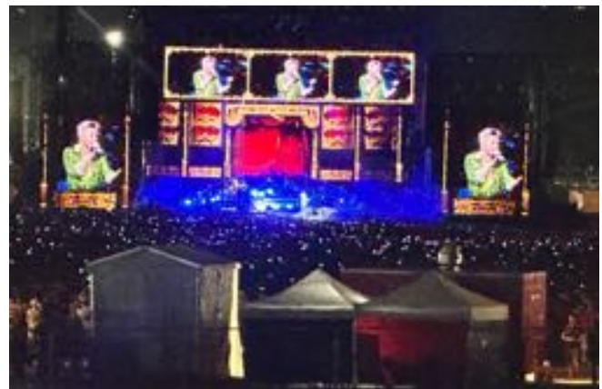
Monster video screens kept the show entertaining

That evening was Queen in concert. We could go early and get a spot standing in front of the stage, but once again, we were beat. The sun was scorching. So we wandered slowly around the track, checking out all the different areas. There was a Mexican canteen, and an Asian bistro. Each had interesting and different food and drink. I have never seen such high prices, and many people in the stands brought their own picnic food. The published info for the event says that you can bring in 16 oz sealed water bottles, but we had no problems bringing in frozen 32 oz bottles. They even searched Sue's bag when her sun umbrella set off the metal detector, and had no problems with anything she had. Just don't bring a metal water bottle!