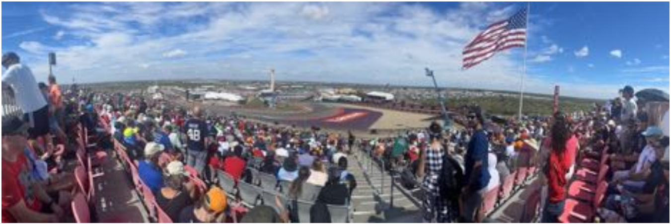
The fisheye view of Turn 1 from our seats