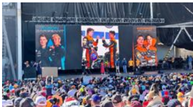
Teasing the drivers in the Fan Zone

Our first stop on Friday was the Fan Zone. We saw the driver introductions, where the F1 hosts made fun of them. It meant missing some of the practice rounds of the Historic GP and women's F1 Academy cars, but it was fun.