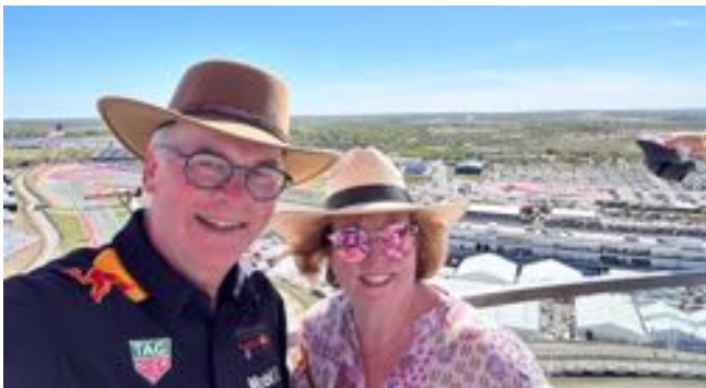
From the top of the Observation Tower. Our grandstand seats were just to the left (my right) of the brim of my hat.