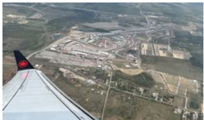
The COTA Circuit is on the flightpath of the Austin airport!

The three day event was just like a big party. Everyone was very friendly and out to have a good time with anyone who would join them. We figured that this was a once-in-a-lifetime experience, but now we are wondering if we can get back there - but bring the kids with next time. It's been many years since we all saw an F1 race together.