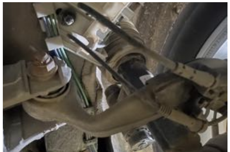
The bent control arm