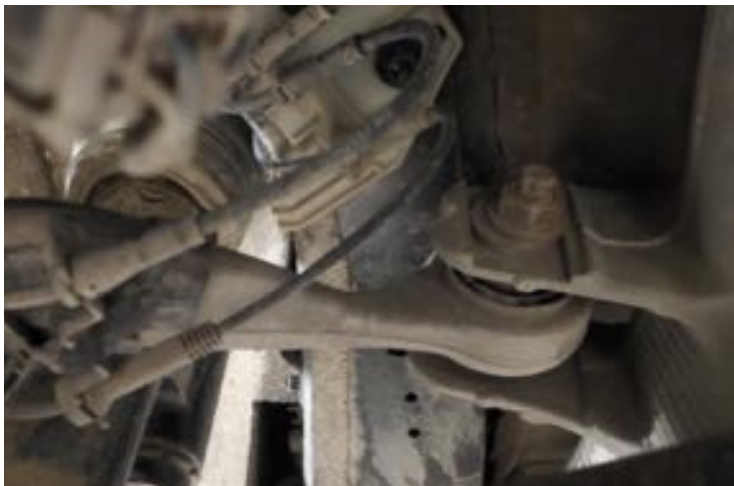
The straight control arm