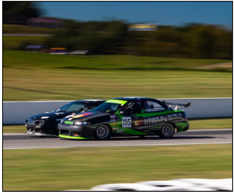
In Rear, the Daley 92 Nissan NX2000

CTMP CELEBRATION OF MOTORSPORTS SEPT 26 / 27