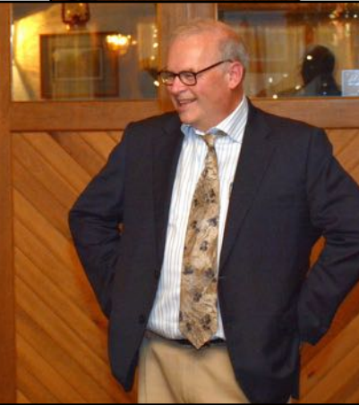
SOME OF THE GROUP; REFLECTING ON A GREAT MEAL