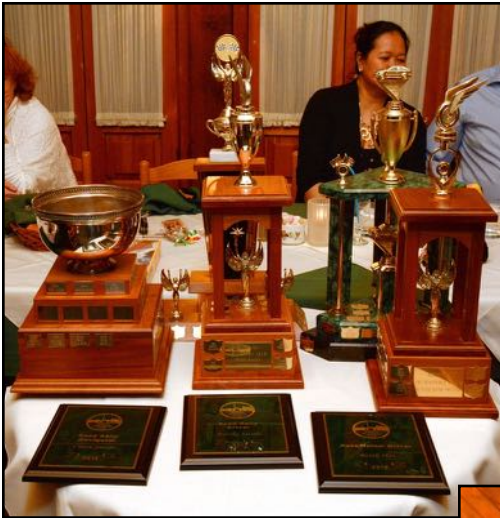
THE AWARDS AWAIT