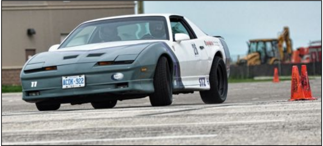
Jay Dover's 1985 Firebird