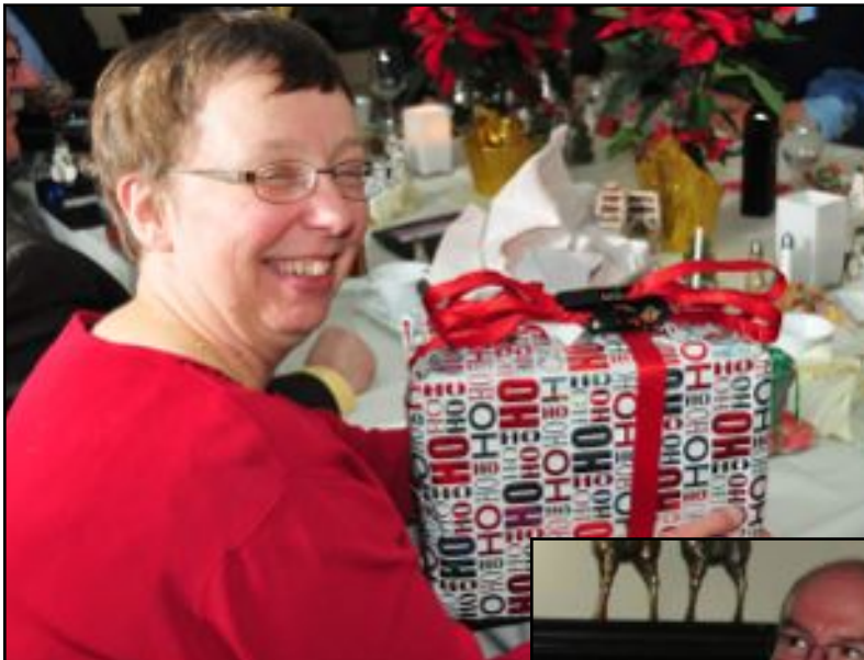
The Door Prizes were fun too.