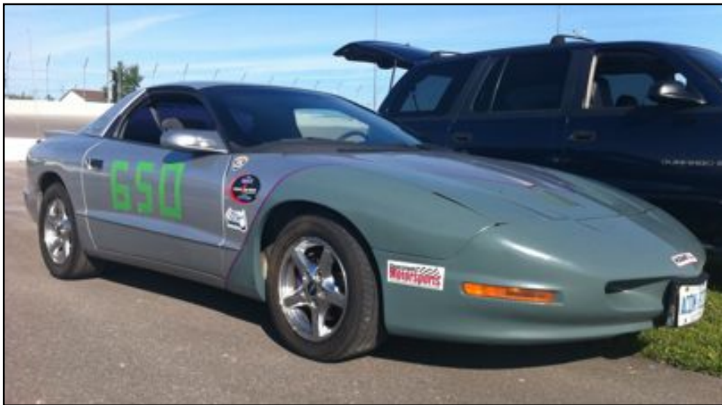
Jay Dover's 1997 Firebird