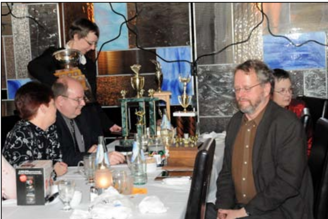
Voted the Table with the Most Awards