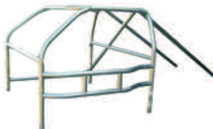
CSC 1503 CHUMP CAR KIT $ 402.50