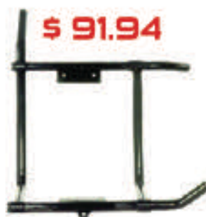
CSC 1605 GENERIC SEAT MOUNT KIT