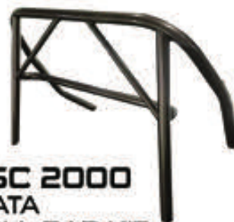
CSC 2000 MIATA ROLL BAR KIT $ 485.00