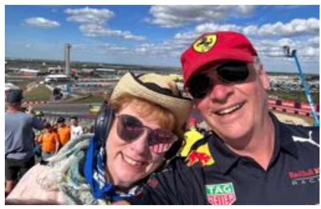
When the anthem played, most people turned and faced the Texas flag.

On one end of the track, there was a giant US flag. On the other end, was a giant Texas flag.