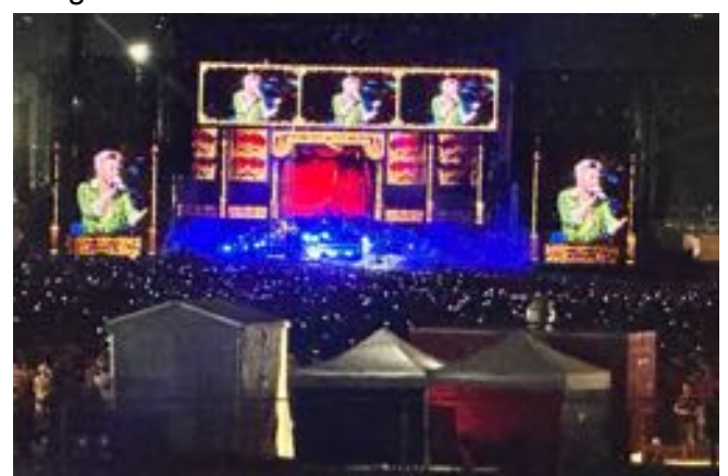
Monster video screens kept the show entertaining

That evening was Queen in concert. We could go early and get a spot standing in front of the stage, but once again, we were beat. The sun was scorching. So we wandered slowly around the track, checking out all the different areas. There was a Mexican canteen, and an Asian bistro. Each had interesting and different food and drink. I have never seen such high prices, and many people in the stands brought their own picnic food. The published info for the event says that you can bring in 16 oz sealed water bottles, but we had no problems bringing in frozen 32 oz bottles. They even searched Sue's bag when her sun umbrella set off the metal detector, and had no problems with anything she had. Just don't bring a metal water bottle!