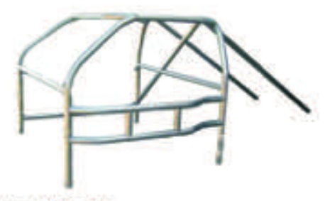
CSC 1503 CHUMP CAR KIT $ 492.34