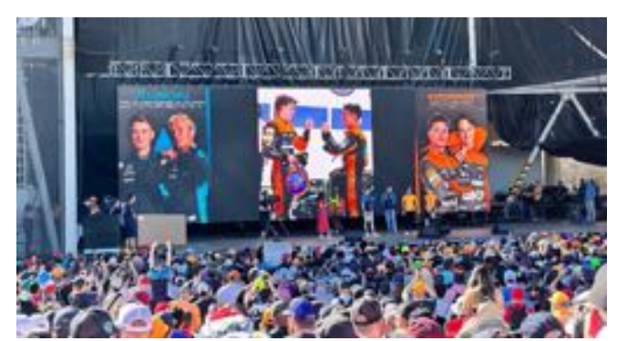
Teasing the drivers in the Fan Zone

Our first stop on Friday was the Fan Zone. We saw the driver introductions, where the F1 hosts made fun them. It meant missing some of the practice rounds of the Historic GP and women's F1 Academy cars, but it was fun.