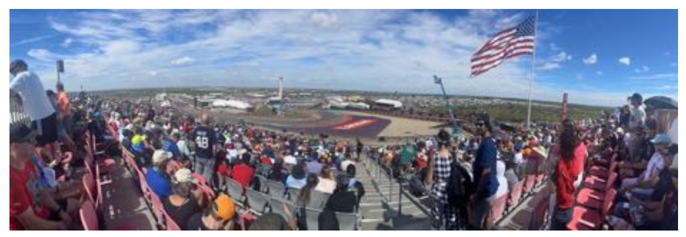
The fisheye view of Turn 1 from our seats